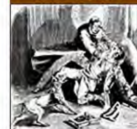
FACT OR FICTION?

The databases selected for searching offer a combined 10,334,488 documents and were last updated as recently as November 28, 2008.